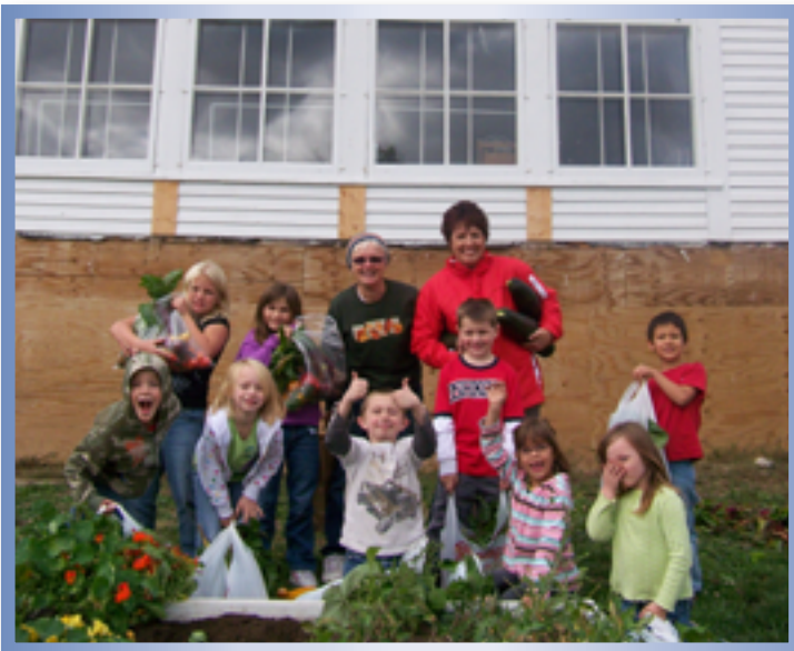
Local elementary students spend the day at Earthrise Farm.