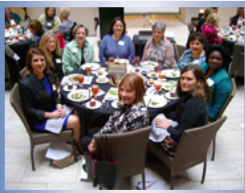
Left: Participants at the Dallas Women's Leadership Luncheon.