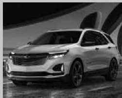
ALL-NEW 2023 CHEVY EQUINOX AWD