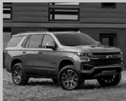
THE NEW 2023 CHEVY TAHOE 4X4