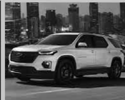
THE NEW 2023 CHEVY TRAVERSE AWD

636.349.3222 | 759 GRAVOIS BLUFFS BLVD, FENTON, MO 63026